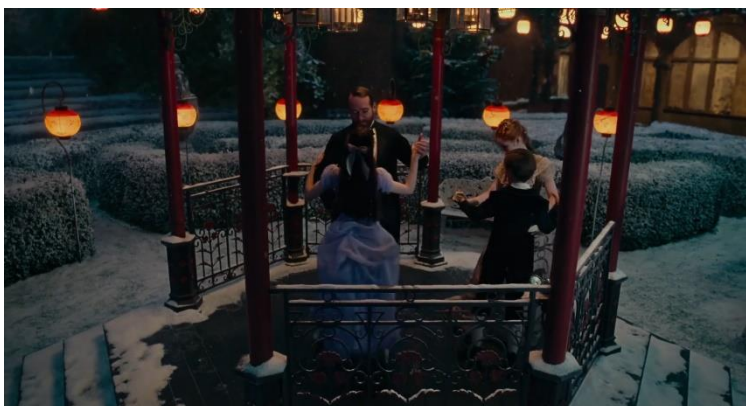
“The Nutcracker and The Four Realms” MPC