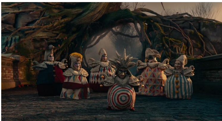
“The Nutcracker and The Four Realms” MPC